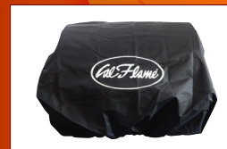
P-Grill Cover Protect and house the grill with a durable vinyl cover.