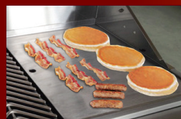
P-Griddle Tray Enjoy fried favorites like eggs or bacon with this griddle tray.