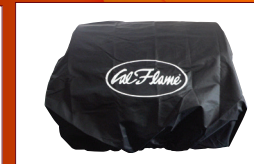
P-Grill Cover Protect and house the grill with a durable vinyl cover.