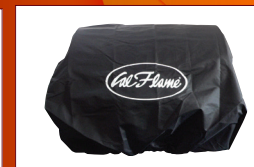
P-Grill Cover Protect and house the grill with a durable vinyl cover.