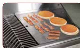
P-Griddle Tray Enjoy fried favorites like eggs or bacon with this griddle tray.