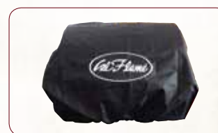
P-Grill Cover Protect and house the grill with a durable vinyl cover.