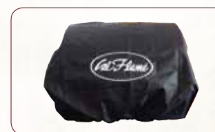
P-Grill Cover Protect and house the grill with a durable vinyl cover.