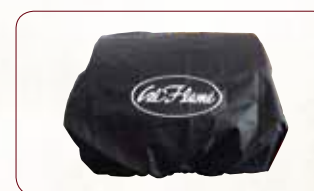
P-Grill Cover Protect and house the grill with a durable vinyl cover.