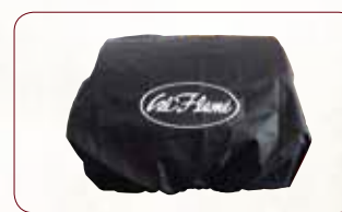
P-Grill Cover Protect and house the grill with a durable vinyl cover.