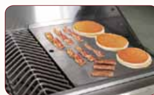
P-Griddle Tray Enjoy fried favorites like eggs or bacon with this griddle tray.